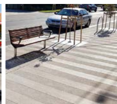
② New seat & concrete feature paving