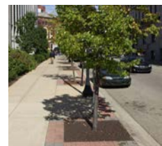
③ New street trees