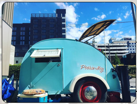
POP UP VENDORS