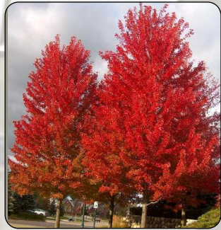
DECIDUOUS SHADE TREES