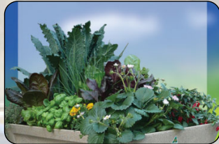
COMMUNITY PLANTER BOXES