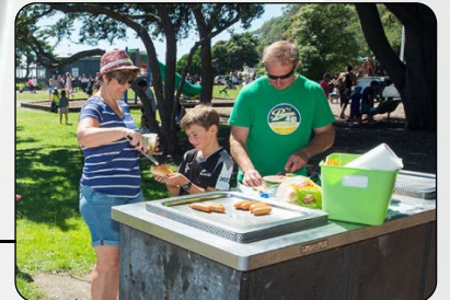
BBQ PICNIC AREA