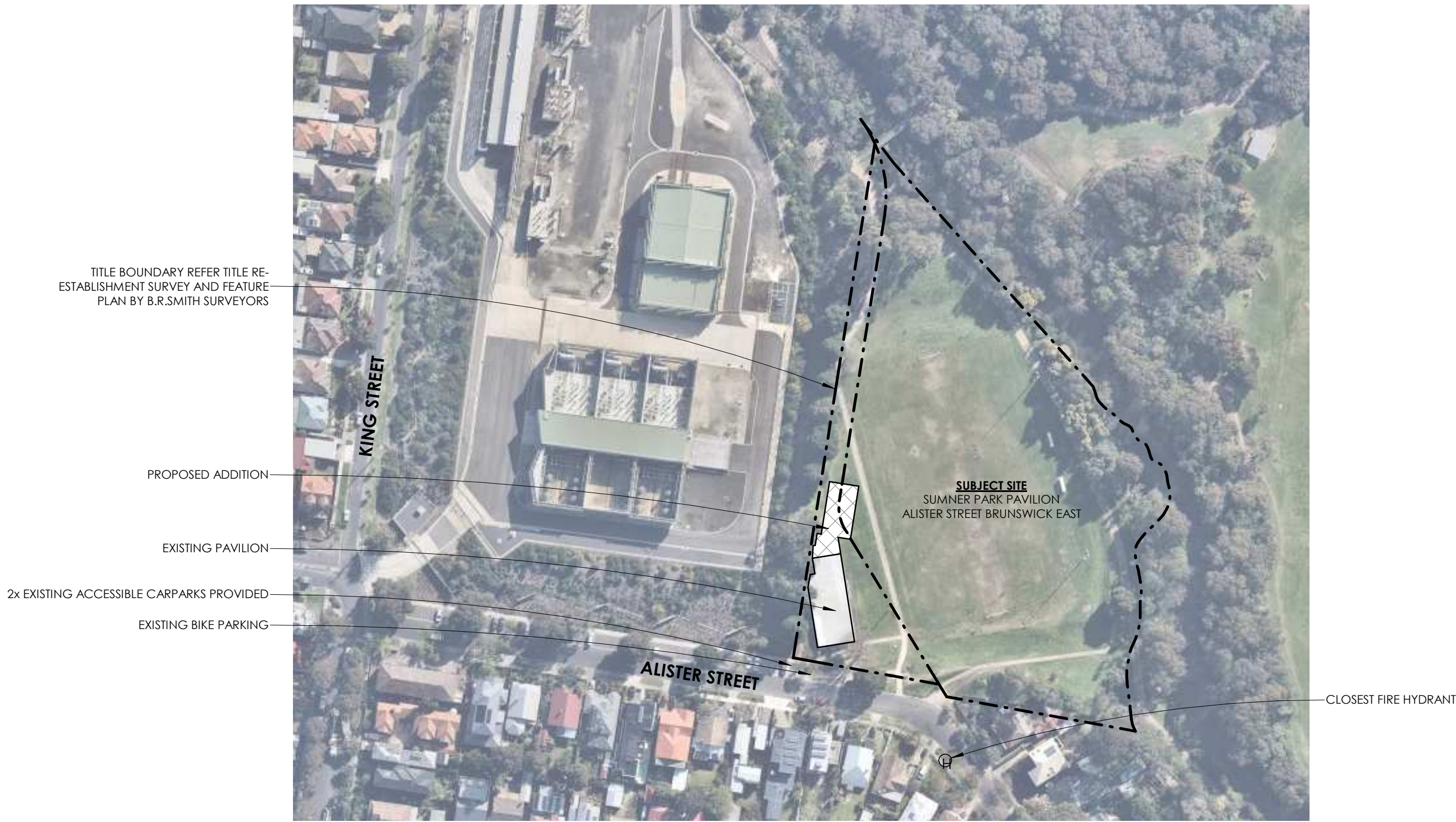
LOCATION PLAN N.T.S