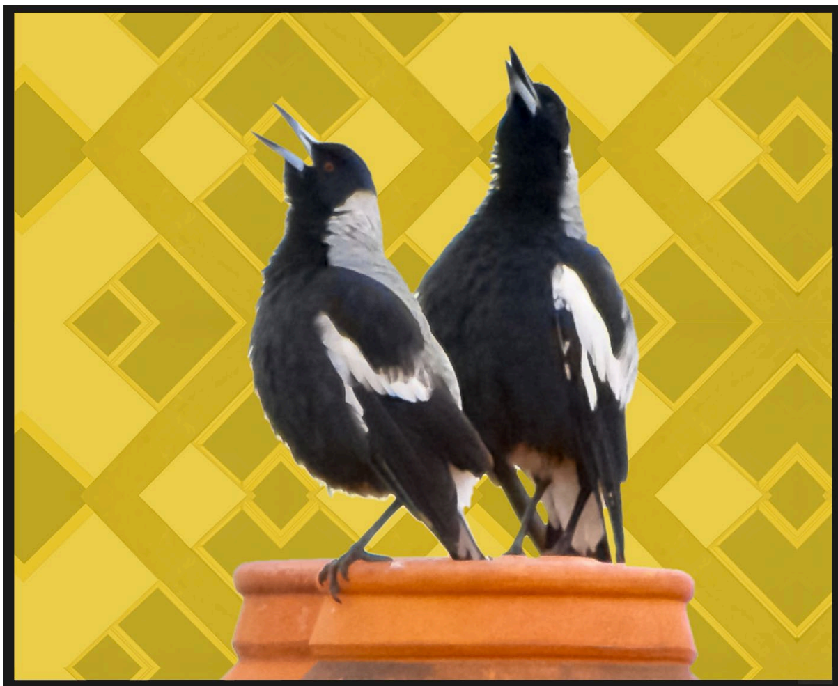
Indicative wall panel

This vast artwork comprises a painted mural that extends the full length of the factory wall, as well as the outer faces of the toilet building. It will be a significant artistic contribution to the park, enhancing and softening the spaces under the steel arbour. Entitled Ancestral Connections-The Ties that Bind , this artwork offers a meaningful connection to Moreland's indigenous history, and builds on this conversation within a contemporary community context.