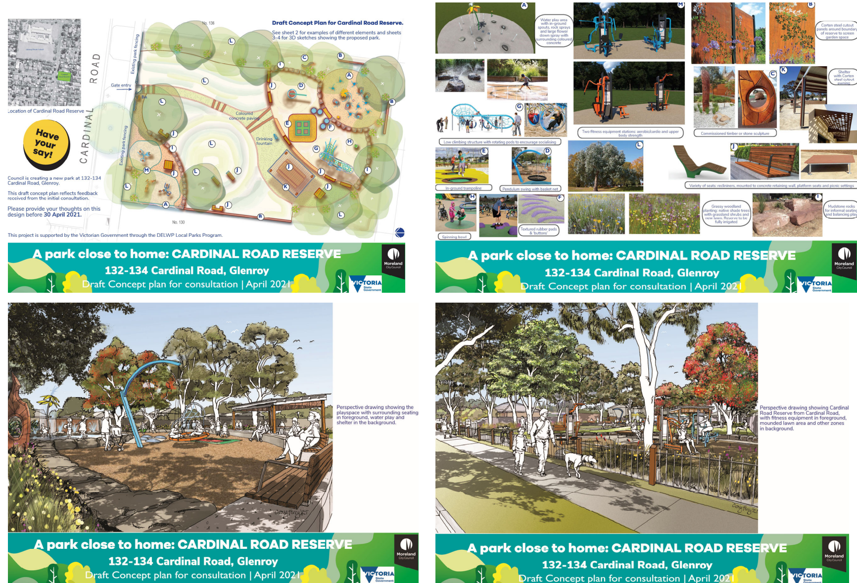
Figure 3: Posters displayed at site.