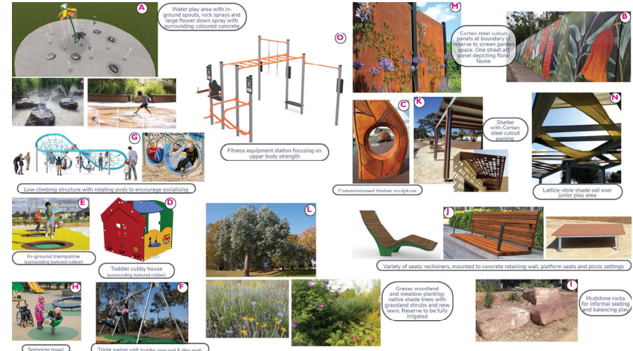
Figure 5: Posters displayed at site.