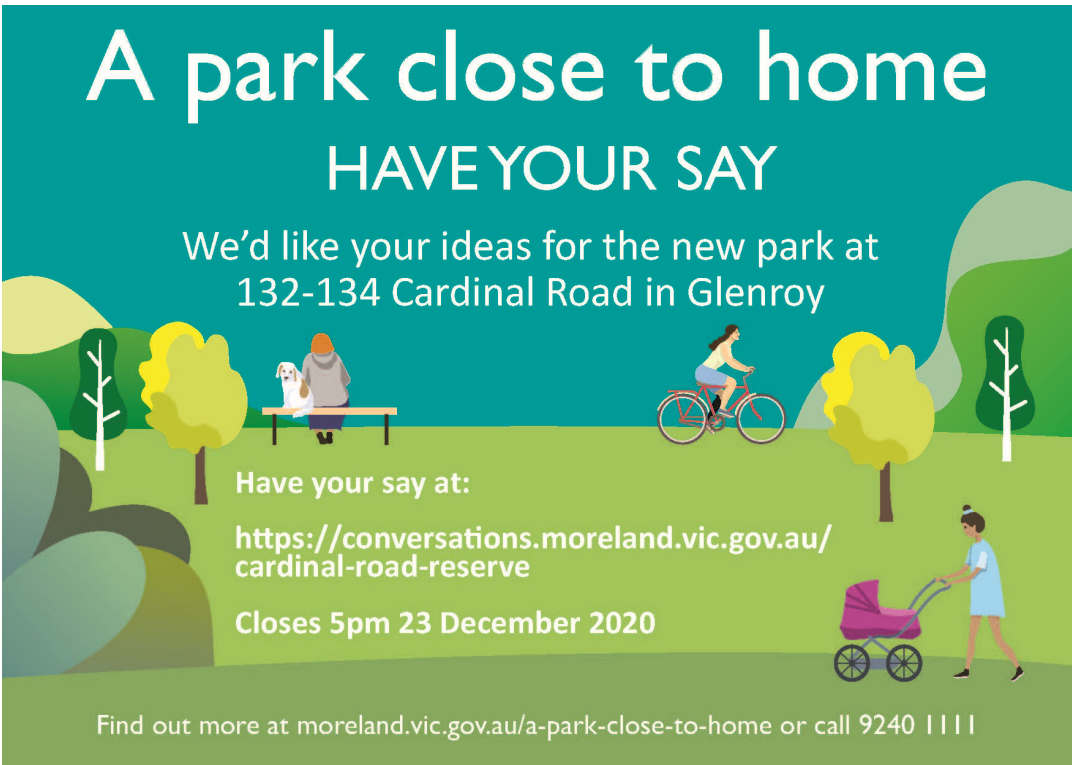
Figure 2: Postcards issued to households within 1km of site.