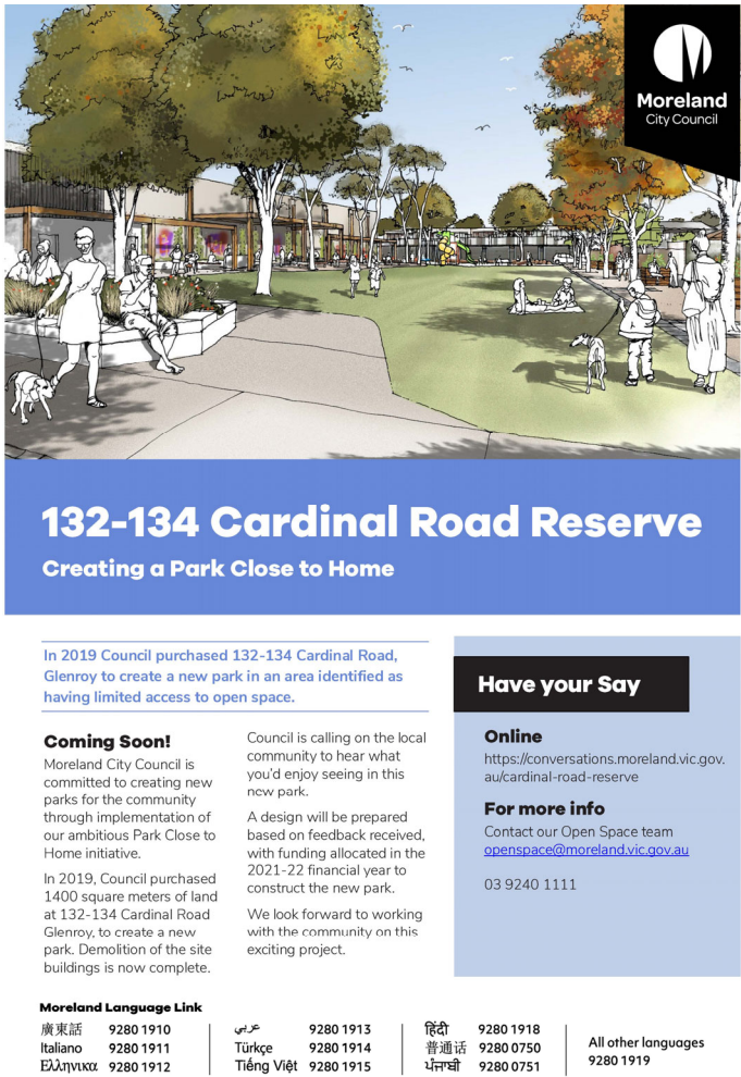
Figure 1: Poster displayed at site.

Below are all feedback received from the community for each stage of consultation for Cardinal Road Reserve.