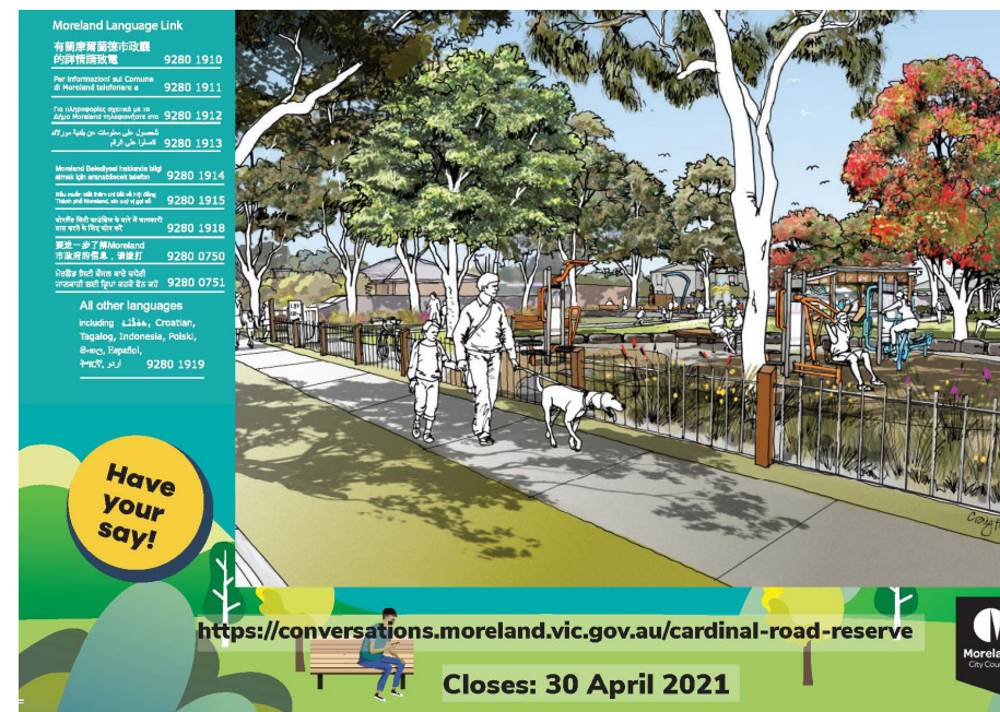
Figure 4: Postcards issued to households within 1km of site.